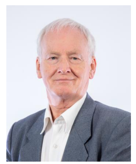
rising cost of living.

This is Telford & Wrekin Council's Annual Scrutiny Report, which highlights the work of our Scrutiny Committees in the 2022-2023 municipal year. The Council, Councillors and Officers recognise the important role scrutiny can play in being a source of new ideas, challenging ways of thinking, and examining current ways of working.